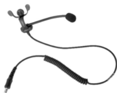
Noise-Com Fits inside choice of ear muff hearing Protector to make a high noise headset