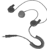
Helmet-Com 2 Bone Mic with dual speaker for fit within all helmet types