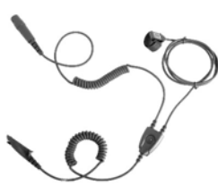
Com-Control PTT For special task applications Small master PTT with remote PTT options