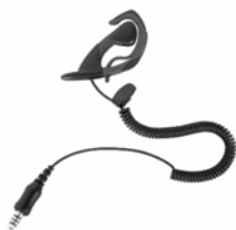
Ultra Light ear set Lightweight yet robust, adaptable to both ears, no blocking of ambient sound