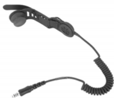
Helmet-Com Bone mic/speaker for unique fastening inside a variety of helmet types