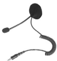
Multi-purpose Headset All-round mounting system with flexible boom microphone