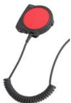
Push to Talk Unit Slim line, IP55 rated, extra large PTT to interface any Savox headset