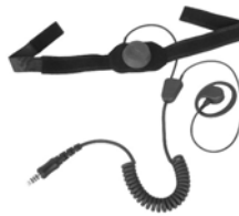
Throat Mic/Earpiece Comfortable/Sensitive throat mic for high noise and under protective suits