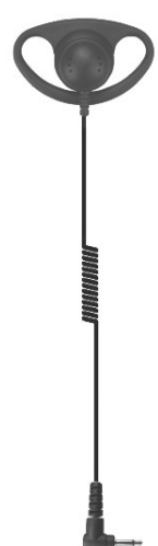
D-Hook/Speaker earpiece ▶▶ $23 Cdn MSRP