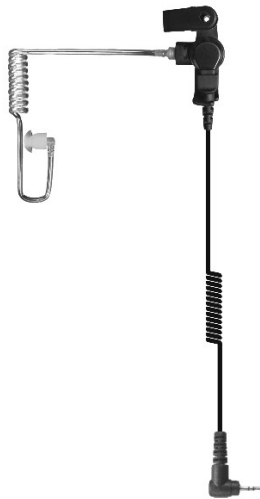
Regular Acoustic Tube ▶▶ $35 Cdn MSRP