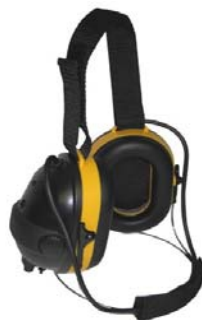
PA4100 Behind-the-head Model