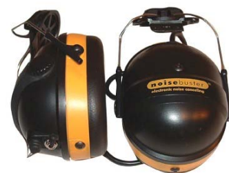
PA4200 Hard-hat-mount Model