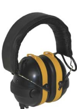
PA4000 Over-the-head Model